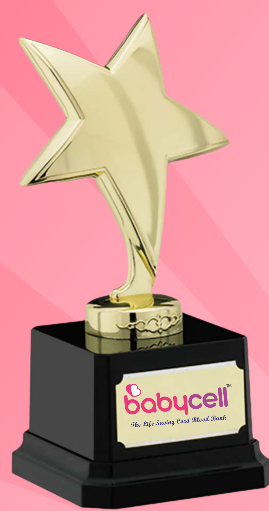
Product Innovations Award by Asian Confederation of Businesses & Stars of the Industry